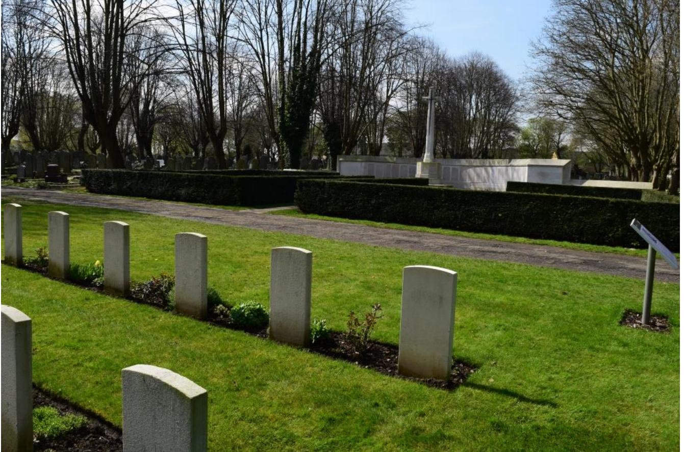
Tottenham Cemetery