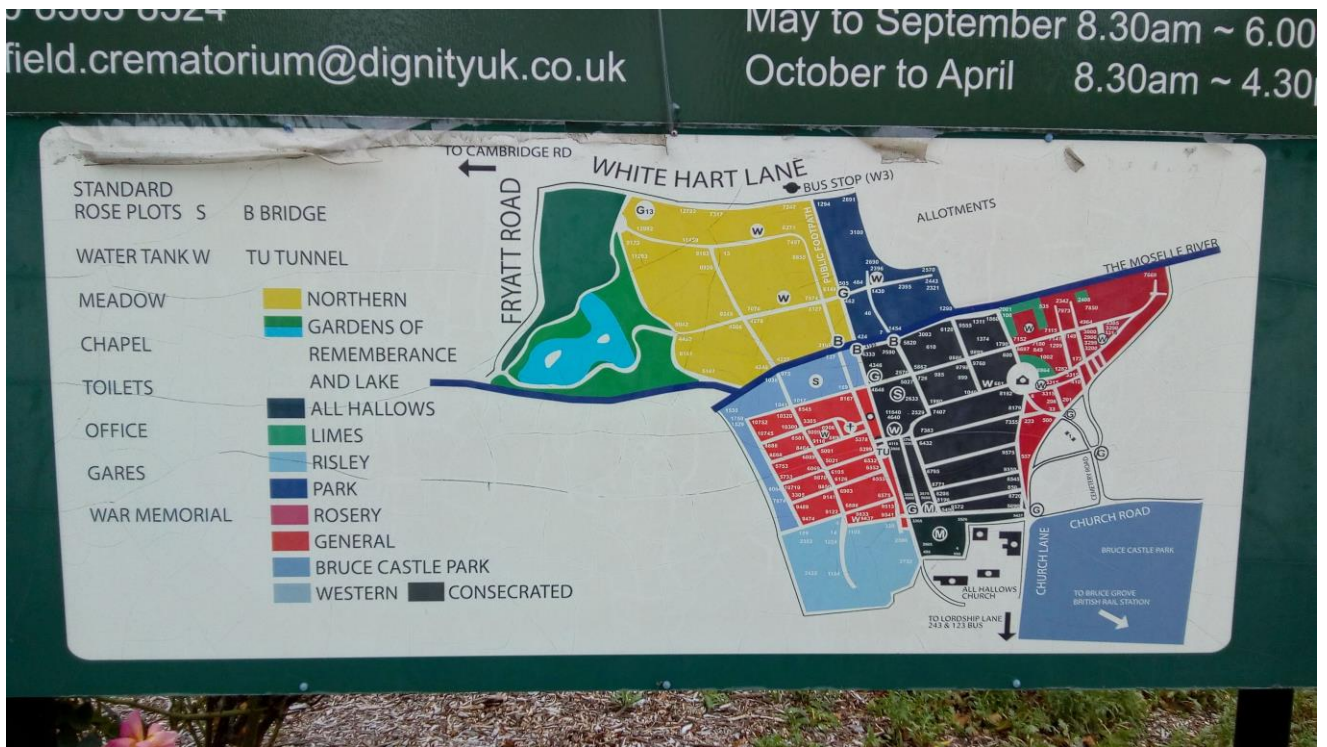
Tottenham Cemetery Map